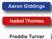
Property Labels (mini, small, large)